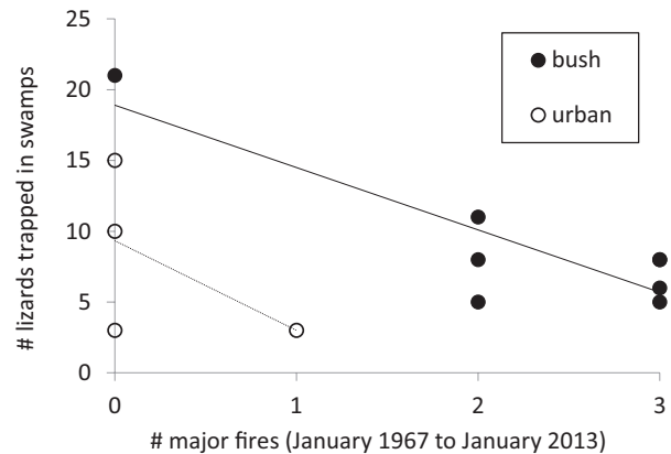
Fig. 3. Numbers of Blue Mountains water skinks. Relationships between swamp type (urban versus bush), fire history (number of fires in the preceding 6–35 years over the period January 1967 – January 2013), and the number of Blue Mountains water skinks ( Eulamprus leuraensis ) captured in montane swamps.

Analysis using all lizards trapped (i.e. including the animals caught in transitional habitat) yielded qualitatively similar results with respect to site type and fire frequency ( P = 0.037 and 0.015 , respectively) to those reported above. Analyses using other measures of fire history yielded similar but weaker effects of both swamp